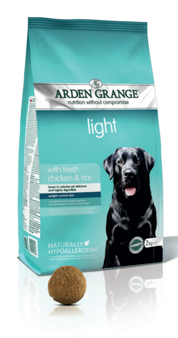
Calories per 100 gms: 327

Trace Elements: Zinc chelate of amino acid hydrate 500mg, Copper chelate of amino acid hydrate 100 mg, Manganese chelate of amino acid hydrate 67 mg, Calcium iodate anhydrous 2.4 mg, Selenised Yeast (inactivated) 65 mg. Antioxidant (rosemary extract).